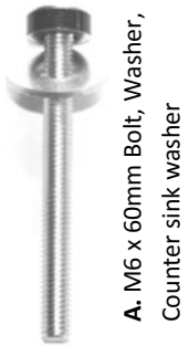
A. M6 x 60mm Bolt, Washer, Counter sink washer